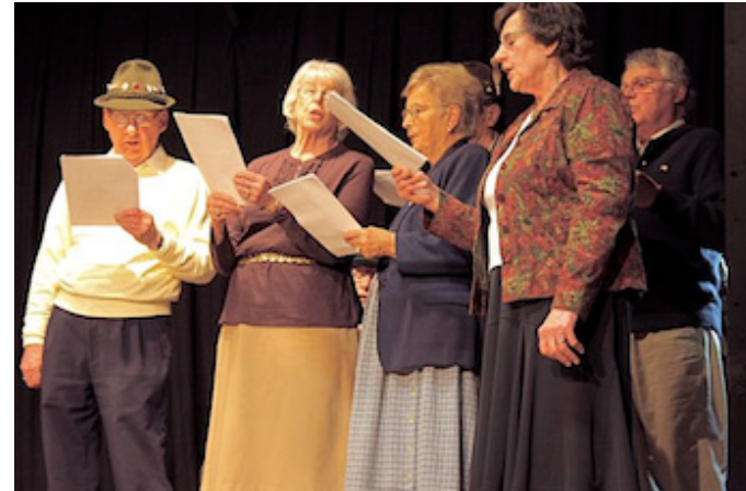
"The Middlers" perform at Amana song, prose, and poetry fest